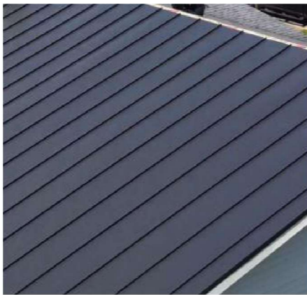
02. BLACK STEEL ROOF