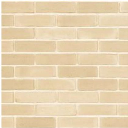
04. FACE BRICKWORK