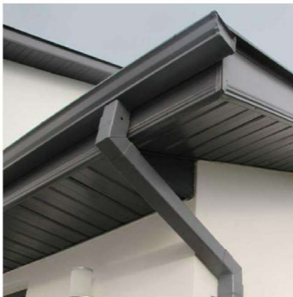
03. FASCIA & GUTTER