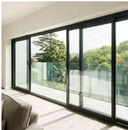
01. ALUMINIUM WINDOWS & DOORS